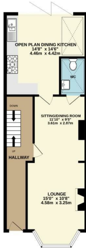
GROUND FLOOR 580 sq.ft. (53.9 sq.m.) approx.