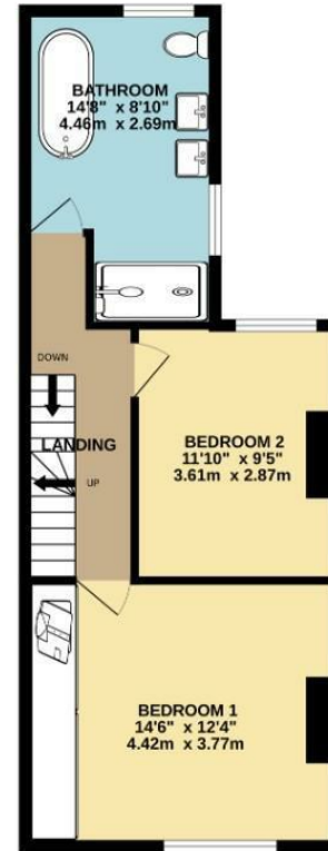
1ST FLOOR 480 sq.ft. (44.6 sq.m.) approx.